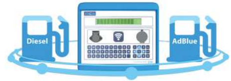
2 Pump Upgrade Available